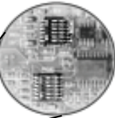
DIP Switch Output Setting